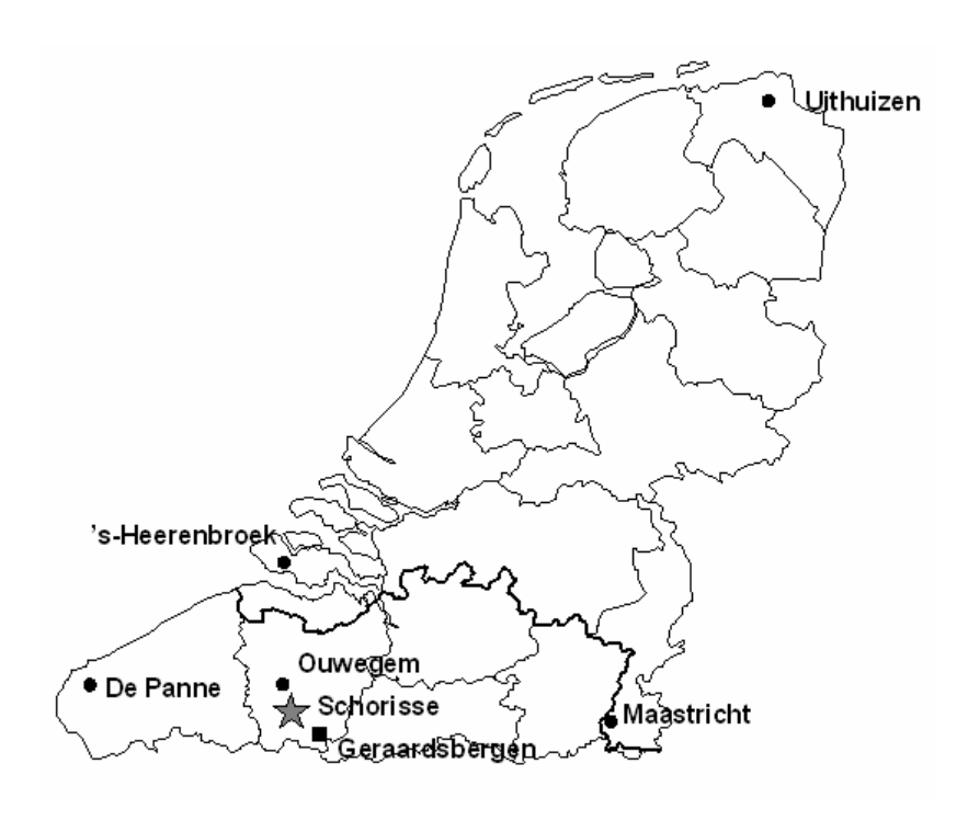
2. The locations of the Flemish and Dutch varieties in the study with single words (indicated by ●). Geraardsbergen (indicated by ■) represents East Flemish in the running text study (see Section 6). The birth place of Wattez, Schorisse, is indicated by a star. The thick line represents the border between the Netherlands (to the north) and Belgium (to the south), the thin lines represent the borders of provinces.