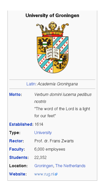
Figure 1: Infobox for University of Groningen