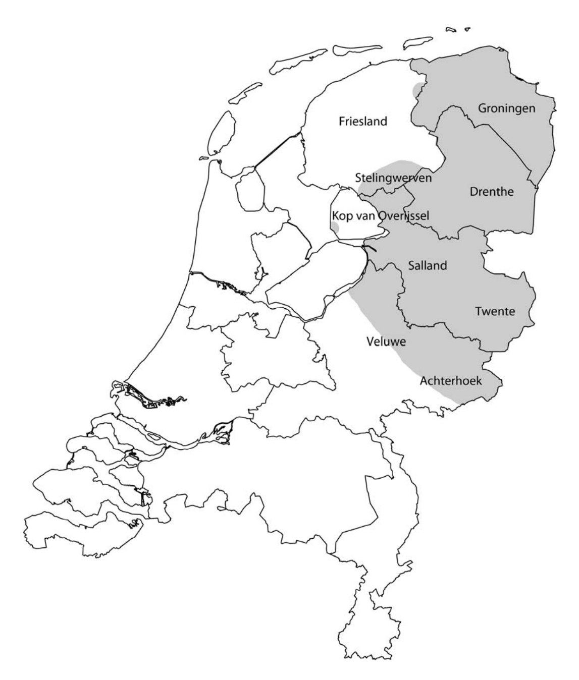
Fig. 1: Lower Saxony dialect area in the Netherlands (in grey)