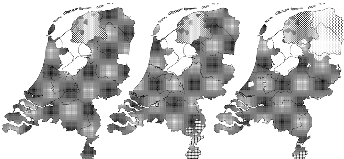
Figure 3: Clustering of varieties in 2 clusters (left), 3 clusters (middle) and 4 clusters (right)

A few interesting sound correspondences between the reference variety (Delft) and the Frisian area are displayed in the following table and discussed below.