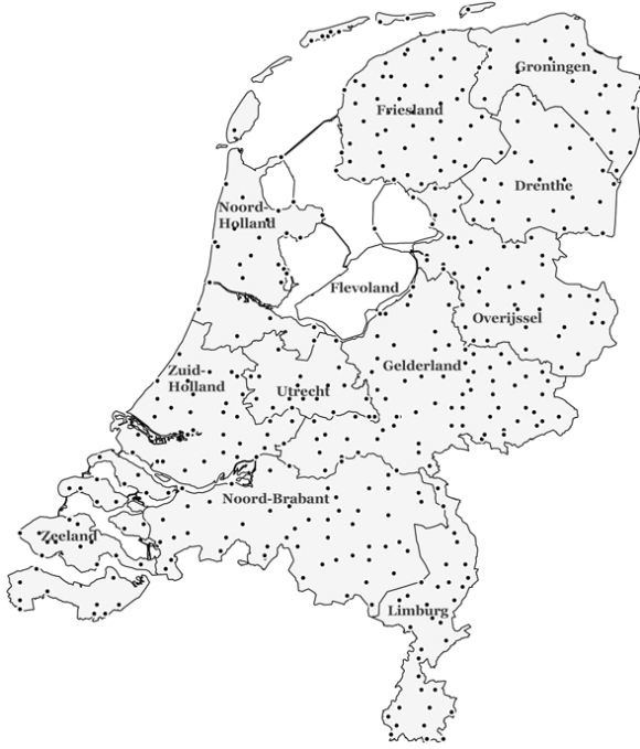
Figure 1: Distribution of GTRP localities including province names

Because Haarlem was not included in the GTRP varieties, we chose the transcriptions of Delft (also close to standard Dutch) as our reference transcriptions. See the discussion section for a consideration of alternatives.