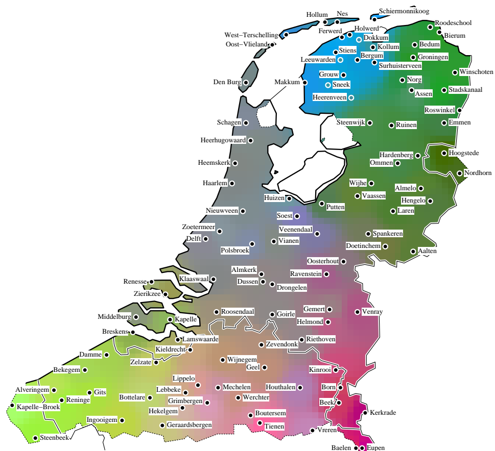
Figure 2: The most significant dimensions in average Levenshtein distance, as identified by multi-dimensional scaling, are colored red, green and blue. The map gives form to the dialectologist’s intuition that dialects exist “on a continuum,” within which, however significant differences emerges. The Frisian dialects (blue), Saxon (dark green), Limburg (red), and Flemish (yellow-green) are clearly distinct. (In case you have printed this on a grey-tone printer, see http://www.let.rug.nl/~nerbonne/papers/tw-se-mm.ps for the correct color rendition.