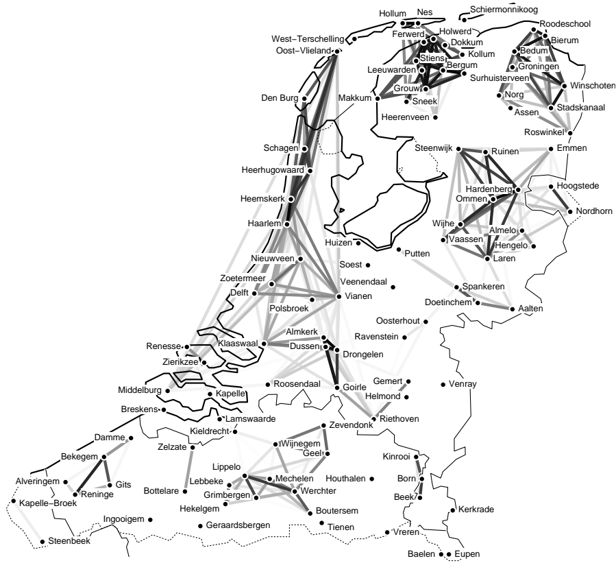
Figure 1: The average Levenshtein distance between Dutch dialects. The darker the line between two varieties, the closer they are in (phonetic) Levenshtein distance. Frisian (top center) emerges clearly as a relatively distinct, but internally coherent group.