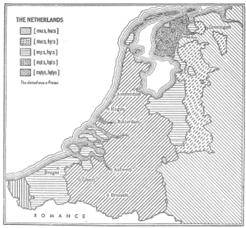
Figure 6. Distribution of syllabic sounds in the words mouse and house in the Netherlands. — After Kloeke.